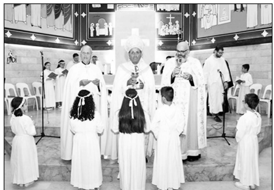
Bishop Antoine Chbeir, bishop of the Diocese of Latakia in Syria, celebrates First Communion in Latakia.